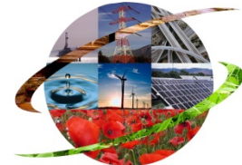
Chair Modeling for sustainable development